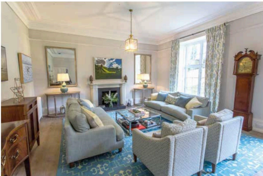
Above: The drawing room.